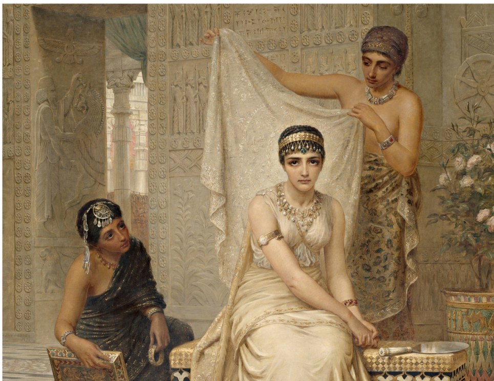
Image: Edwin Long, 1878, Queen Esther . National Gallery of Victoria, p.307.1-1